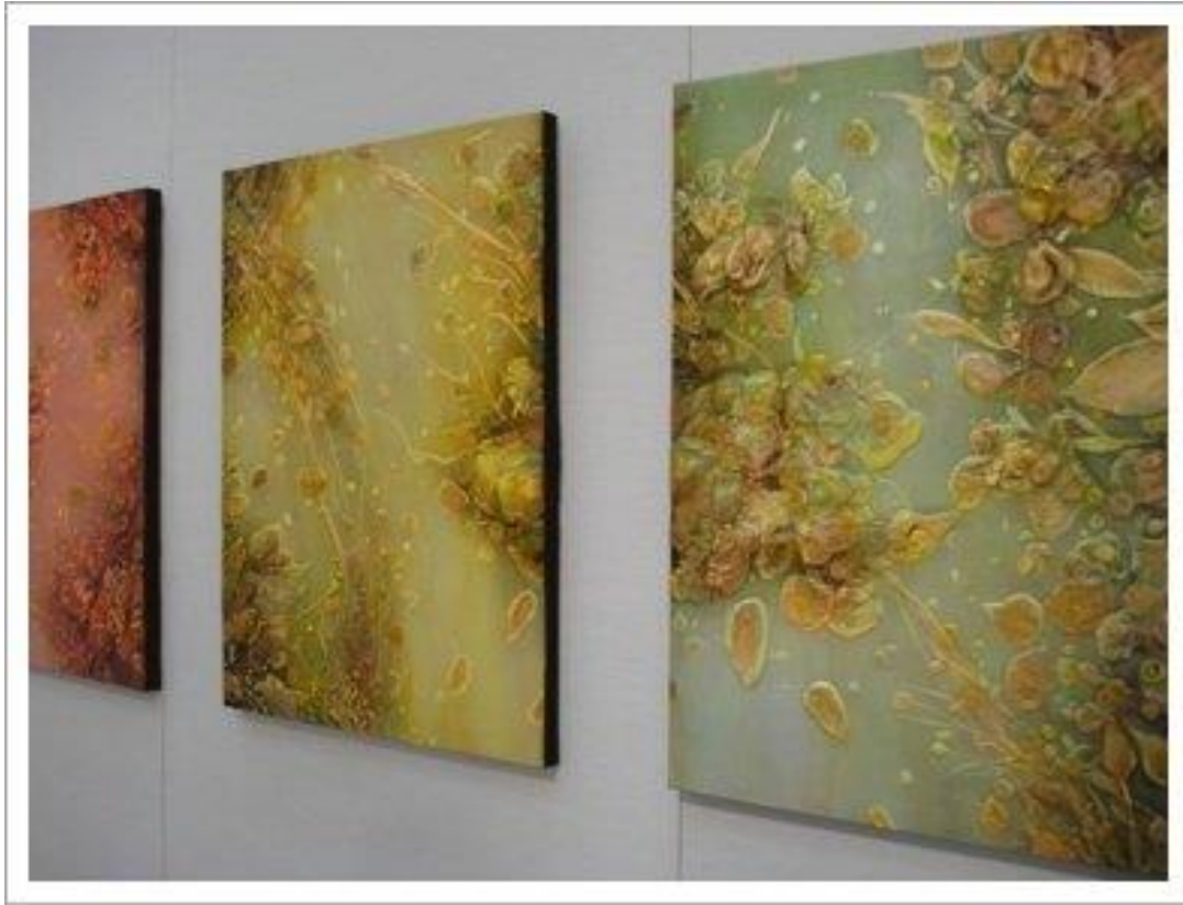
Figure 10. Untitled 6 (2007). Thesis Exhibition. Hyekeun Park.