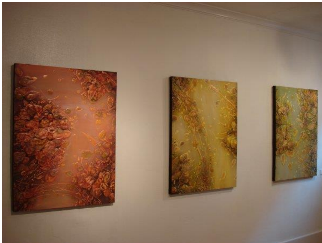
Figure 11. Untitled 6 (2007). Thesis exhibition. Hyekeun Park.