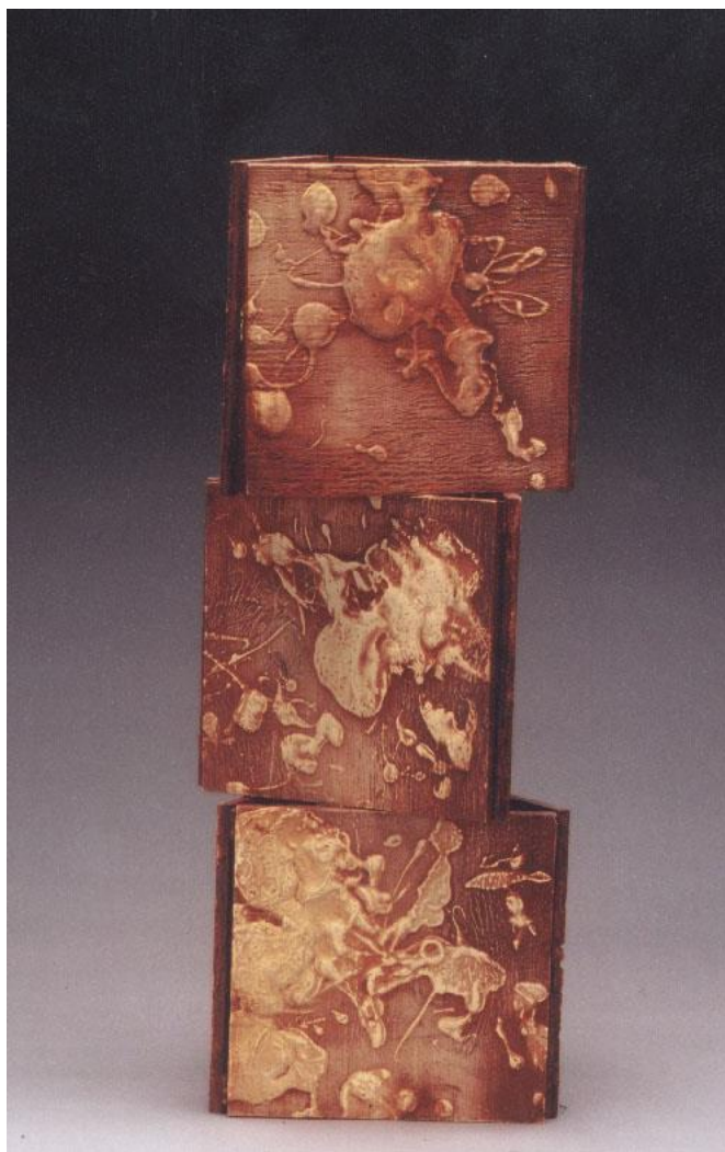
Figure 8. Untitled 5 (2006) Hyekeun Park.