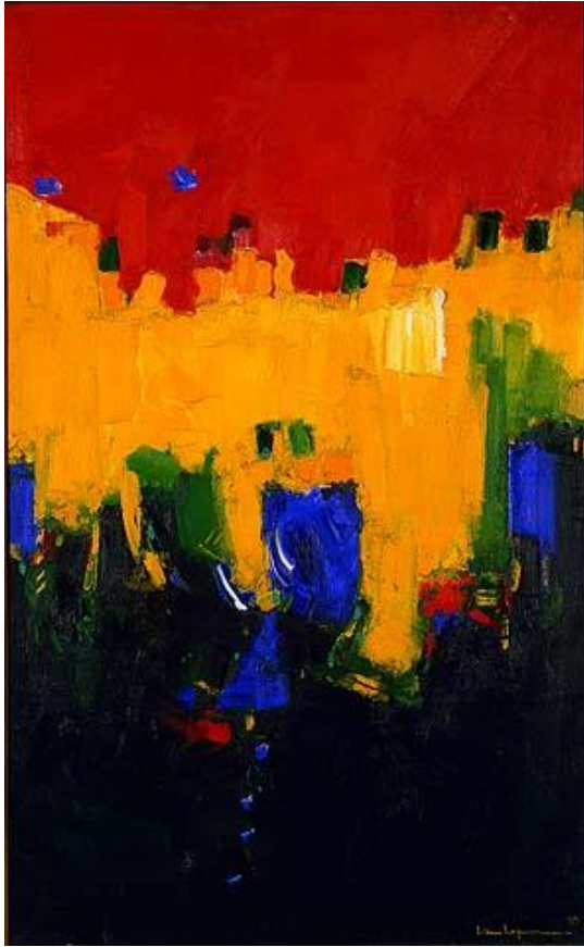
Figure 4. Above Deep Waters (1959) Hans Hofmann