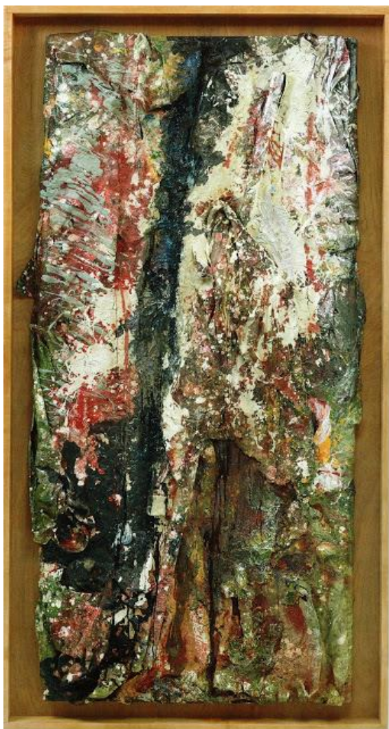
Figure 6. Sam Gilliam, Composed (formerly Dark As I Am ), 1968-74