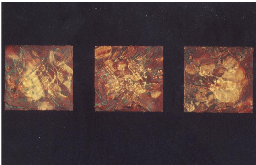
Figure 5. Untitled 2, 3, 4 (2006). Hyekeun Park.