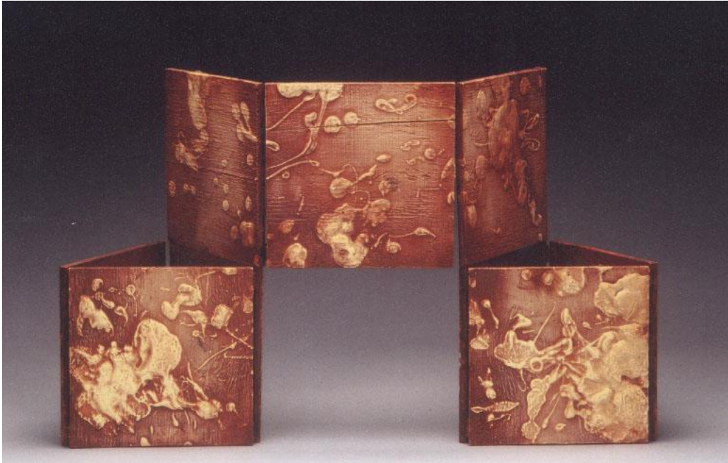
Figure 9. Untitled 5, spread out. Hyekeun Park.

For my final work, I attempted to incorporate color into my paintings for the very first time. The paintings go in order of reds and pinks, to yellow, and at last to green and blue (Fig. 10). The first painting is reminiscent of my earlier works where I was hesitant to utilize color. In the next transition I use yellow that shows the neutralized state of my mind as I begin to express and come to terms with my different identities. At last, the final piece shows lifting with green and peaceful blue which represents the peace of mind that I was able to achieve through my art processes here at RIT. Through my art, I was able to sort through the turbulent and unclear boundaries of my identity in the different environments and accept them as they were and I hope this final piece represents that. (Fig. 10)