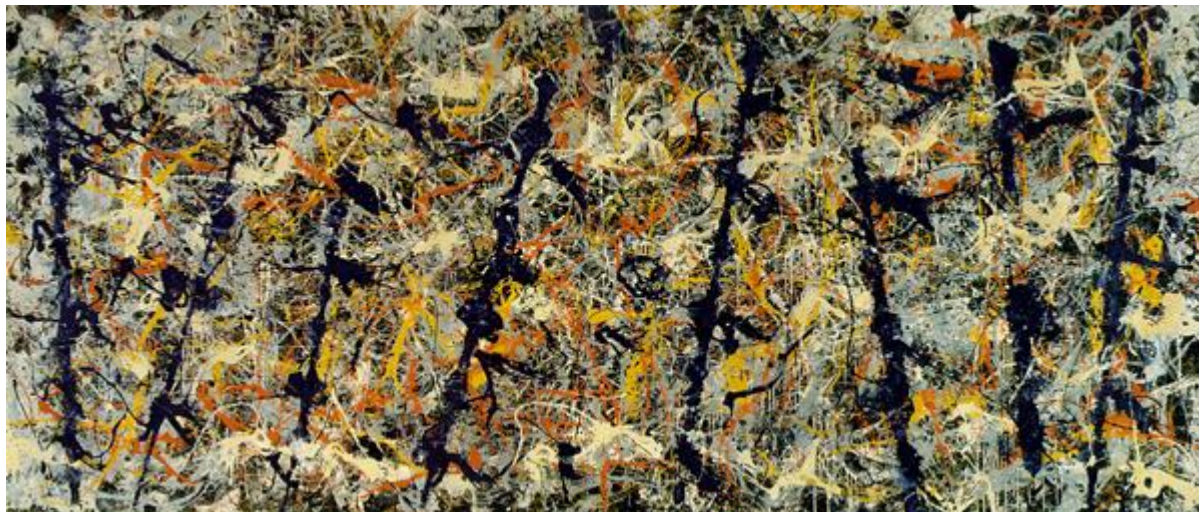
Figure 2. Jackson Pollock, Number 11, also known as Blue Poles (1952). Australian National Gallery, Canberra

The pour over technique found in my paintings was hugely influenced by the works of Jackson Pollock, specifically Blue Poles (1952).