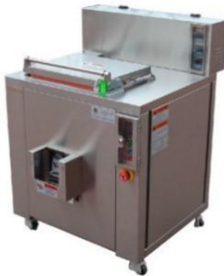
Figure 2. Ecovim-66 system.

We determined the major opportunities for end markets and performed a detailed literature review to ascertain how the Ecovim-66 output material could be used, based on key characteristics needed. For each potential end market use, we defined “optimal” ranges of key parameters. For example, feed for dairy cows requires carbohydrate and protein levels to be within a certain range. Using the data collected by Dairy One, the characteristics of the output materials were compared to these ranges to determine if the dehydrated food was a potential match for that end market. Qualitative information was also included in the analysis where appropriate. Though food safety would be an important requirement in utilizing the dehydrated material in animal feed markets, analysis specifically related to food safety was outside the scope of this assessment.