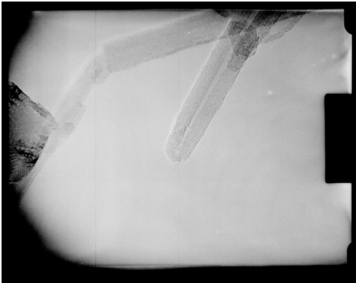
Figure 1. TEM of the functionalized carbon nanotubes

Multiwalled carbon nanotubes were either bought from Deal International (Rochester, NY) or laboratory synthesized at RPI. The synthesized samples showed higher responses compared to the commercial samples. The tubes were functionalized as discussed in the literature (13). The TEM of the functionalized carbon nanotubes are shown in Figure 1.