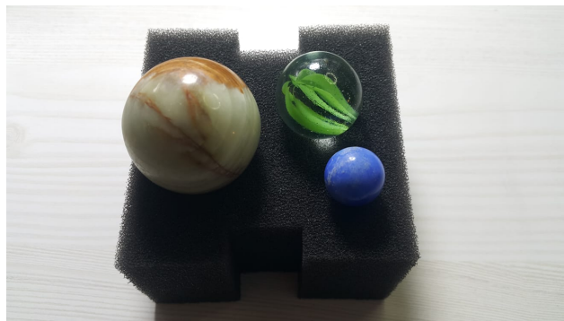
Figure 2: The setup during the wait

If the student is motivated to make your proposal, you can now share your inquiry proposal and ask your student if they would like to make it. Tell your student that you are going to put the marbles on the sponge and wait a week and see what will change. If your student starts sharing their guesses, you are in step three. You can make the student think at this step with questions such as: “What changes will happen to the marbles and the sponge at the end of a weekend, will the changes (eg scars) be different from each other?”