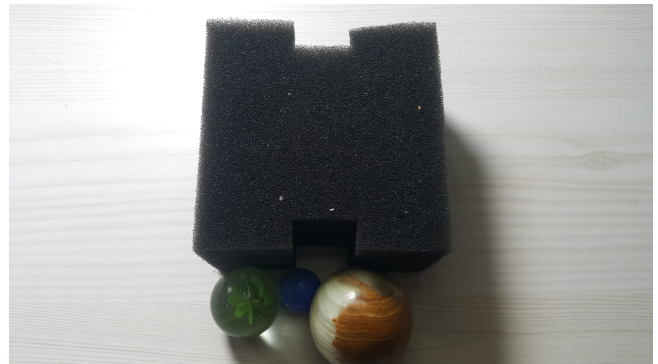
Figure 1: Elements of the inquiry setup; three different balls and a piece of sponge

standing of the nature of science and scientific process skills, as well as to reflect on the concept. A student who is visually impaired and a researcher were found at each step. The ten basic steps, which were formed by preserving the three basic phases, were changed according to what the student in the process was curious about and wanted to do. Therefore, the shared ten-step inquiry process was created as a result of a natural learning flow with a high school student who is visually impaired.