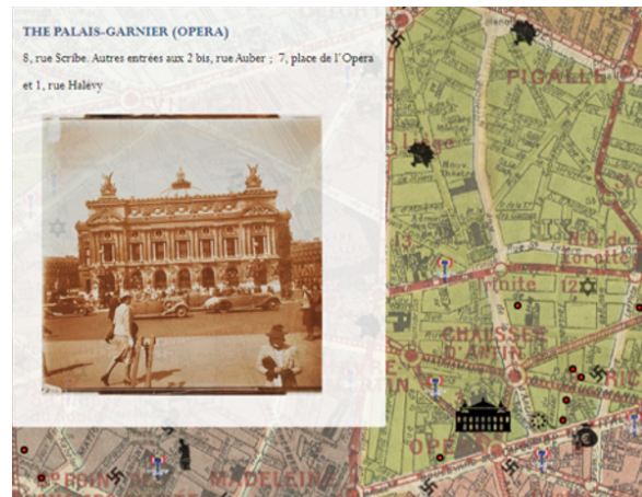
Fig. 1. Map of Occupied Paris

The Paris Sous L'Occupation mapping project was created in 2017 for a French language and culture course at a large east coast university. The course centers on Paris during the German Occupation, and the mapping project aims to better connect students with this time, place, and history so far removed from them. Students find it challenging to conceptualize the meaning of space through course readings and videos alone. For example, students were shocked at the proximity of a velodrome, where 13,000 Jews were rounded up on July 16th, 1942 and taken before being sent to concentration camps, so near to the Eiffel