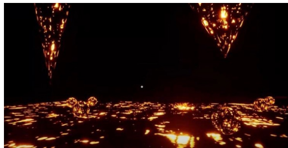
Fig. 2 &3. Early concept renderings of the virtual Dream Sections

and explore a unique blend of devised theatre, film, and 3D game design.