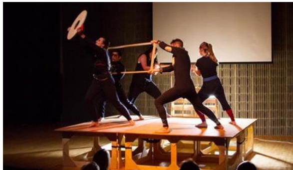
Fig. 1. SOMNIUM performing at the 2016 Rochester Fringe Festival

With the rapid onset of COVID-19 as a global pandemic, theatres across the world were forced to close their doors and turn off the lights. Safety guidelines that discourage physical closeness, encourage face coverings, and set limits on the number of people in a space are incredibly important to minimizing the spread of the virus. While essential, these regulations also impede how the performing arts have always operated.