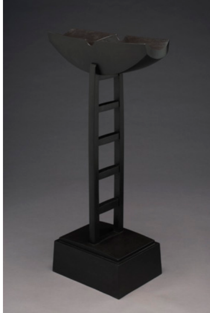
Crucible, Mahogany, Paint, 17" x 17" x 29"

These pieces were interesting not for their appreciable qualities, but for the new paths they began to suggest. There were elements of ritual, references to architectural forms, overt references to specific objects, and in combination these elements suggested a way forward. I began to find that the objects I was working on were still very much about a history of functional forms.