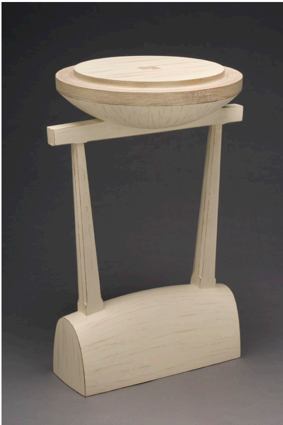
Millstone Table, Mahogany, Paint, 20" x 18" x 30"

My first attempts at this led to interesting discoveries. In an effort to encourage the unexpected, I chose to resist the temptation to evaluate the new work until it was well under way. This was successful in generating several pieces, the first of the group that would come to comprise this thesis. In the final quarter of my first year I built the Millstone Table , the Little Red Vessels and a vessel on stand called Crucible . Looking to these objects on the bench as they were being made opened up new possibilities. I chose to paint the work, a decision that was a very conscious one. Having made a good deal of furniture that was about wood and its grain, I wanted to obscure these qualities, to literally hide the wood so as not to be distracted by its visual impact. Paint became central to the way I developed this new way of working. As I painted more of the work, I came to see paint as a way to highlight qualities of the material I had not been able to capture with natural finishes. Form could be seen more clearly, whether overtly through tooled surfaces, or subtly in the way the grain telegraphed through the paint.