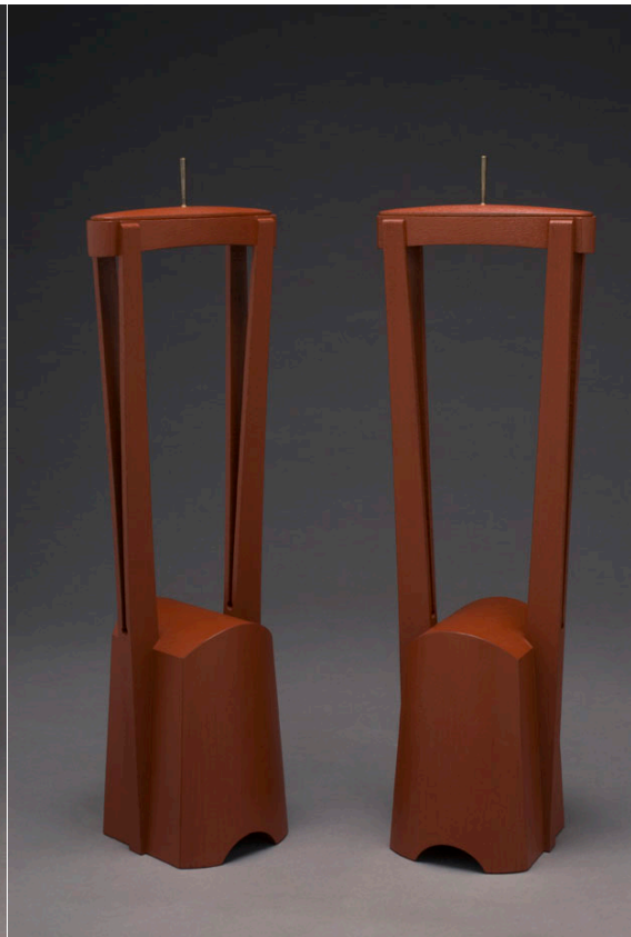
Little Red Vessels, Mahogany, Paint Brass, 8 1/2" x 7" x 27"