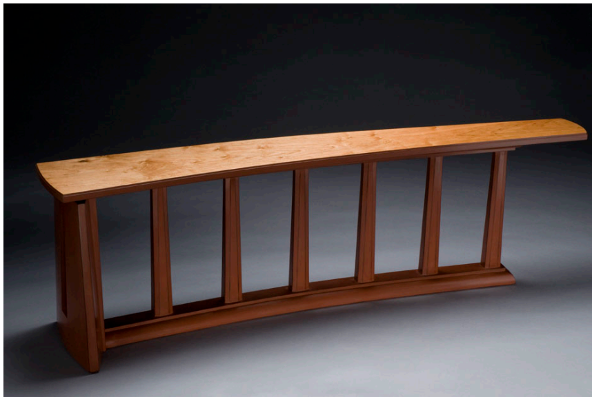
Banister Bench, Cherry, Mahogany, Charcoal, Paint 67" x 13" x 18"

These inspirations were evoked, often most interestingly, through memory. This role played by memory is not to be understated in this process. Many recollections were simply peripheral; some were just fleeting images, and some of them were useful as specific memories. These recollections would at times initiate an idea for a new piece, such as the Banister Bench , which began as a recollection of a moment on a staircase. The view through a stair rail to a sculpture, a ceramic house that has lived on my father's dresser for many years was a vivid one. The reconstruction of that moment as a piece of furniture was effectively an attempt to encapsulate the emotional quality of that experience. The resulting piece of furniture, I think, does communicate some of these qualities, but it does something else for the viewer. It invites viewers, through the use of an architectural language, to engage in the recollection of their own experiences.