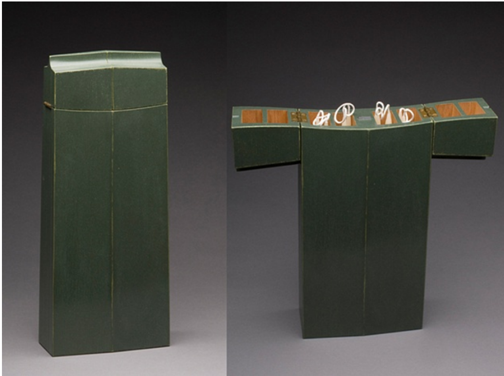
Candle Box, Mahogany, Paint, 7" x 4" x 16"

In some instances, utility became vital to the development of meaning, while in others the functionality of a piece was born out of a more conventional furniture language. In yet other instances, the work was about function, but that function was compromised or employed in an unexpected way. These more poetic objects, often celebrating common but timeless functions, seemed to have the most interesting combinations of form and meaning. With Candle Box , a simple vessel was rendered in such a way as to provide it space and nuance in its meaning. Intended as an homage to the memory of the annual purchase of candles for my mother on her birthday, the piece was simultaneously evocative of references to the monolithic form often taken by burial markers and Japanese form. It was also oddly similar in the division of its parts and the movement of the lids to Brancusi's Kiss .