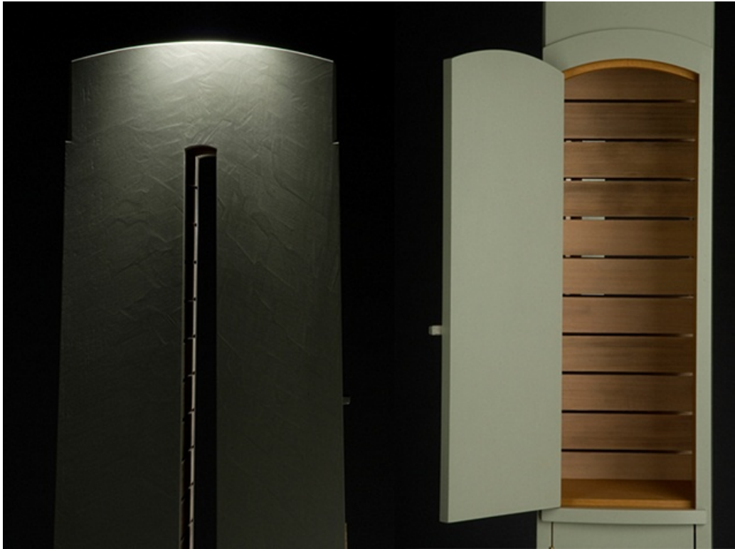
Chimney Cupboard, Mahogany, Douglas Fir, Paint, Graphite, 83" x 25" x 14"