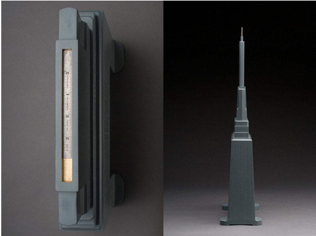
Reliquary for a Burned Inch, Mahogany, Paint, Gold Leaf, Brass 16" x 4" x 23"

Some of the strategies I experimented with brought work dangerously close to the potential clichés bound up in aesthetic New England. Nowhere is this more obvious for me than in the Millstone Table . In this piece, paint and texture are joined with forms that are evocative, but the surfaces of these forms miss the mark in their near decorator quality. Employing the more literal reference to a millstone to strike at a perceived meaning proved deceptive. Upon further contemplation, the millstones that inspired the table have power less for what they look like than for their role they might play as markers of a way of life. Taken one way they are little better than garden gnomes, though they do retain some inherent beauty. When taken another way, they have the potential to draw allusions to an important cultural process. The Millstone Table treads too close to the former.