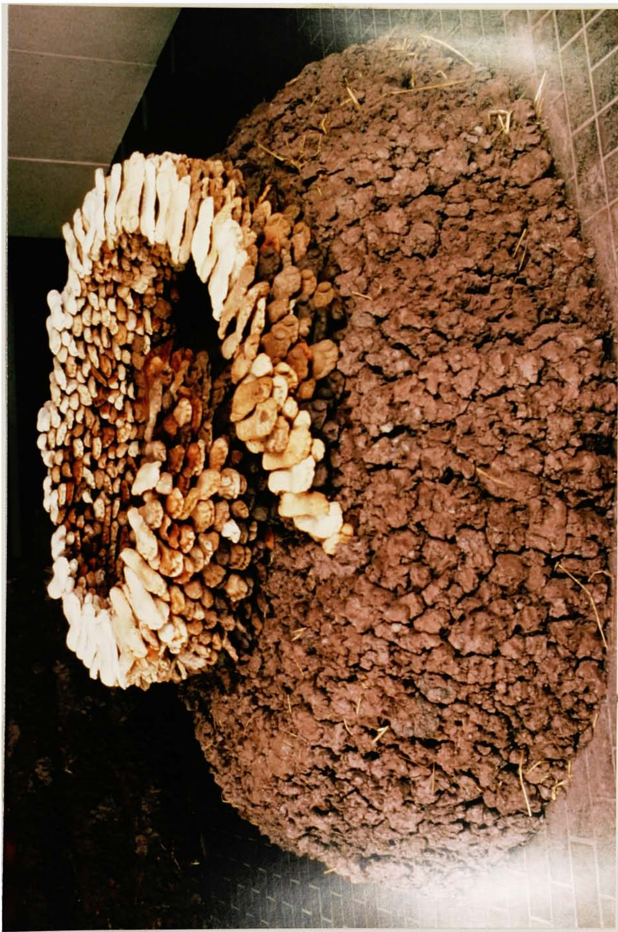
Plate 3: Detail CYCLE: Existence