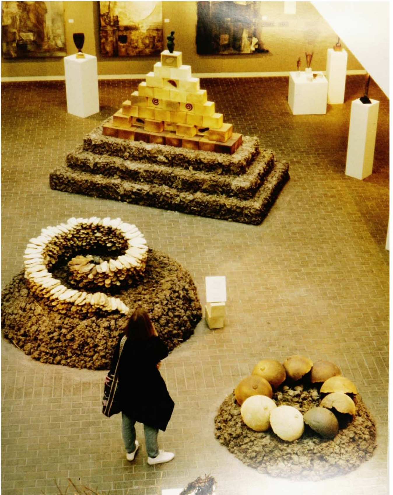
Plate 1: CYCLE. Installation View