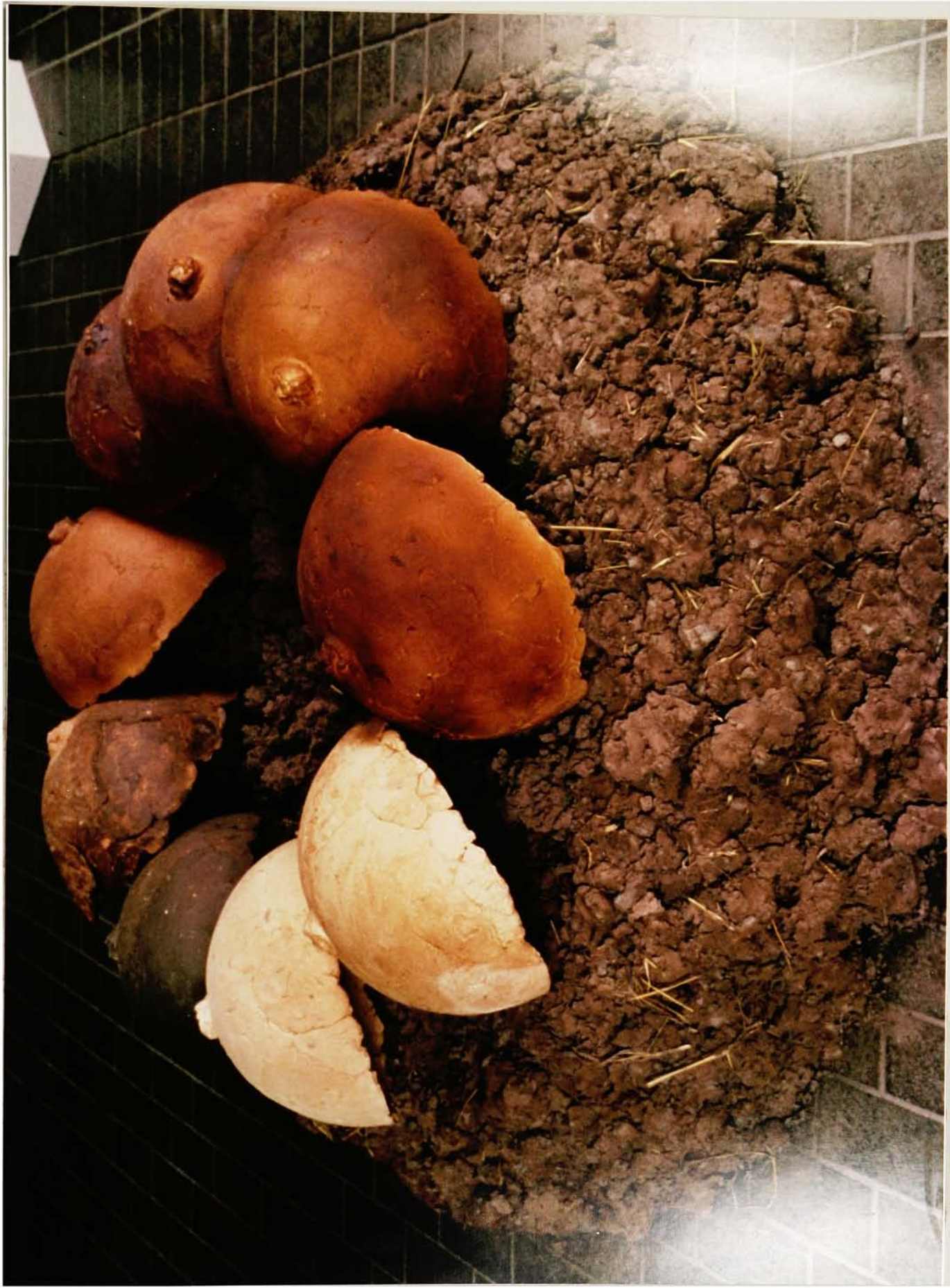
Plate 2: Detail CYCLE: Circle Of Life